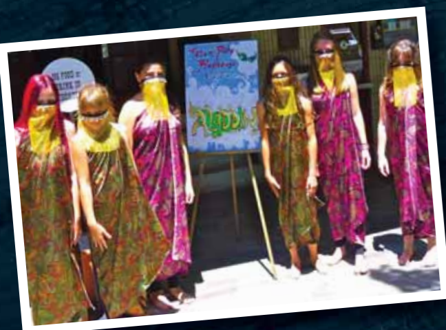
2011 Theatre Campers